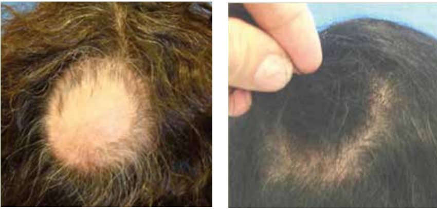
Figure 7 (A) Before and (B) 12 months after one platelet-rich plasma treatment session for alopecia areata

The third application field for PRP concerns alopecia areata. For this indication, evaluation is particularly difficult; indeed, the evolution is naturally capricious. It must therefore be concluded that the case has been developing for more than 1 year without success. Also, digital measurements are delicate as the areas of regrowth are irregular. Macrophotography is the best method evaluation in this disease. For now, only case studies rather than standardised evaluations are available. Nevertheless, obvious improvements can be seen (Figure 7).