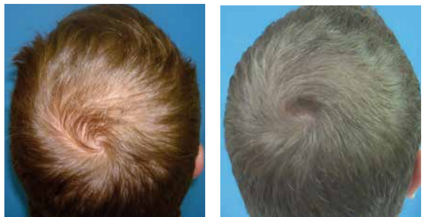
Figure 4 (A) Before and (B) 8 months after one session of platelet-rich plasma treatment

Greco and Brandt 17 found that traumatising and infusing growth factors into the scalp reversed miniaturisation over an 8-month period when compared with control. Ten hair samples were taken from each patient; five patients in the Control Group (CG) and five from the Treatment Group (TG). Hair diameter was measured using a Starrett micrometer. In the TG, 60 cc of blood was drawn and 10cc PRP was processed. The CG also had 60 cc of blood drawn, but this was not processed. The scalp was first traumatised in both groups with a 1mm microneedling roller to initiate keratinocyte