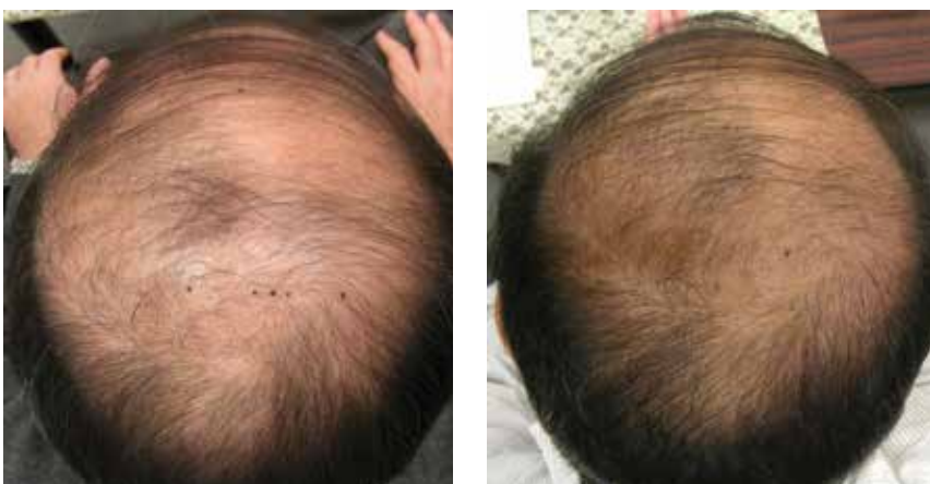
Figure 2 (A) Before and (B) 12 weeks after one session of platelet-rich plasma treatment

For a number of years, the expectations of physicians