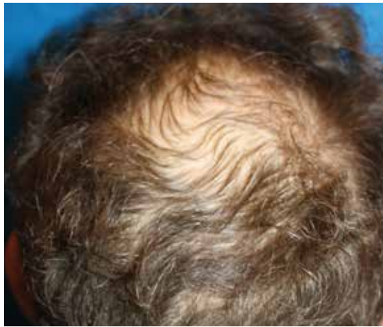
Figure 6 (A) Before and (B) 9 months after two platelet-rich plasma sessions